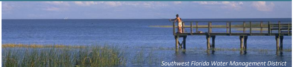
Southwest Florida Water Management District

326 W. Marion Ave. Punta Gorda, FL 33950-4417 (941) 575-5090 CHNEP.org